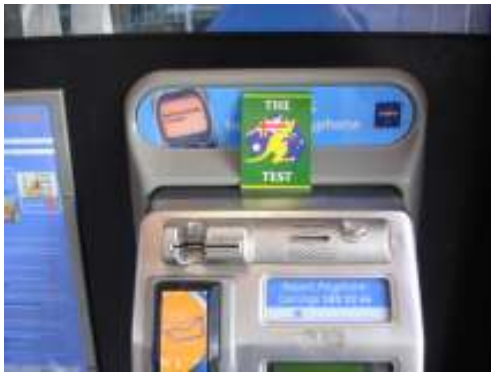
Phone boxes are ideal for tracts