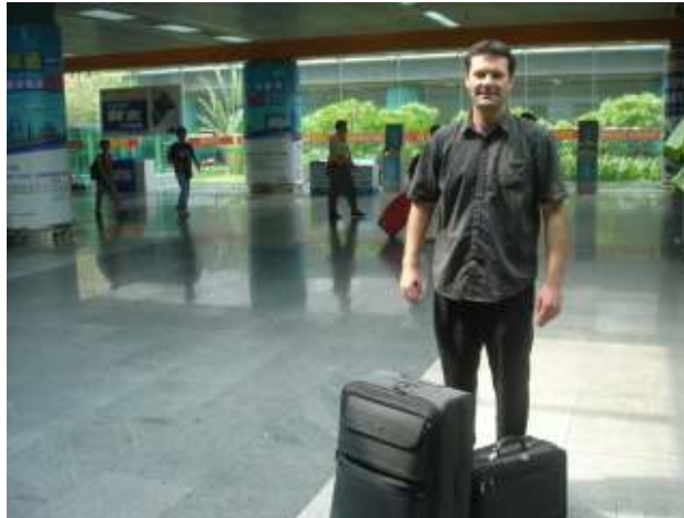
Looking relieved after getting over 70 Bibles through Chinese immigration without being stopped

Getting Bibles into China is still a critical work as the Chinese government controls the Bibles that get printed inside China and decides where they go.