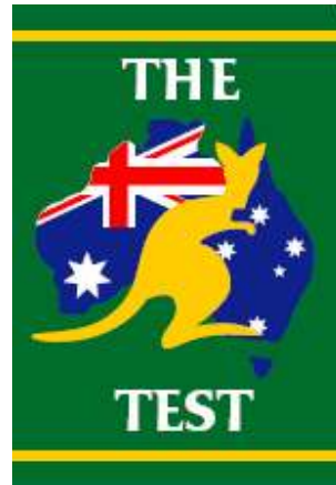
'The Test' Oz version

The following is a diagram showing how the new structure will look and where Kiwitracts fits into the bigger picture: