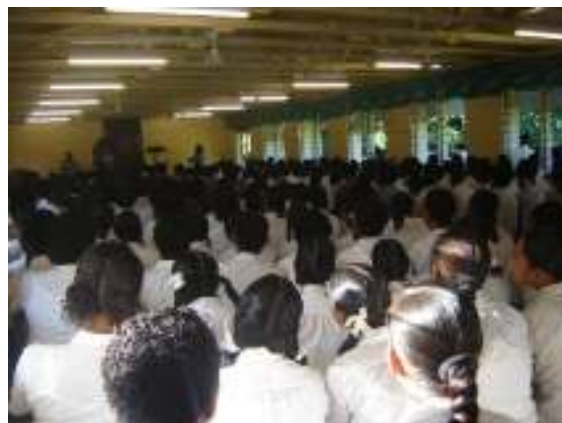
One of the schools we shared with.