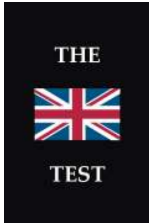
The UK 'Test' tract

Demand for our overseas resources is continuing with 5,000 of the UK 'The Test' tract ordered by Operation Mobilisation in England. This connection has enormous potential as OM is operating in over 100 countries around the world.