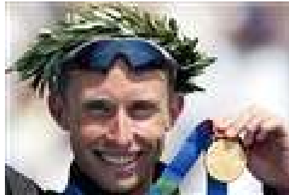
Hamish Carter: Olympic Gold medallist was recently given 'The Test' tract at a petrol station in Mt Eden.

Over the years God has opened up opportunities for the ministry to reach out to a number of New Zealand's most famous/infamous citizens. Over the next few months we will highlight some of them: