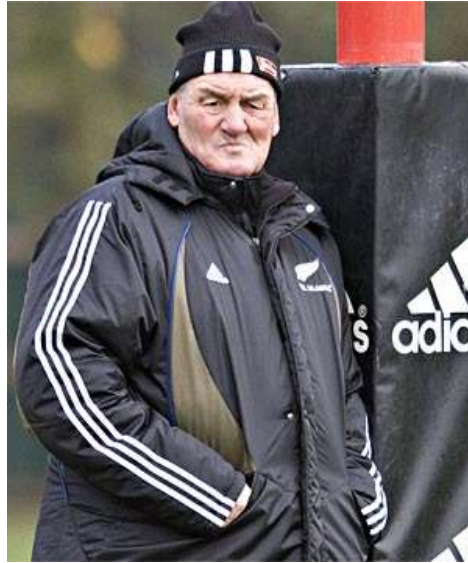
Sir Brian Lochore: The All Black great was handed a tract in Fiji in 2005.