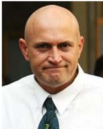
Clint Rickards (infamous police chief) was given 'The Test' tract at a rugby game in Auckland