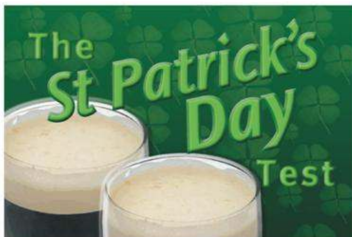
The new St Patrick's Day card (just smaller than an A5)