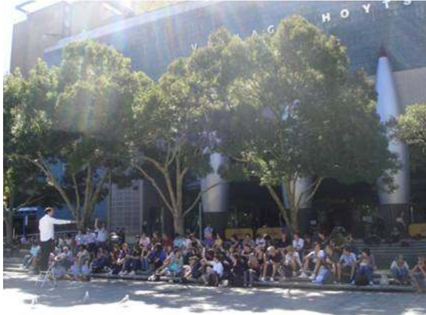
Open-air meeting in Aotea Square

A big thankyou to those who have helped out by praying, handing out tracts, offering words of encouragement, paying for parking and just offering support.