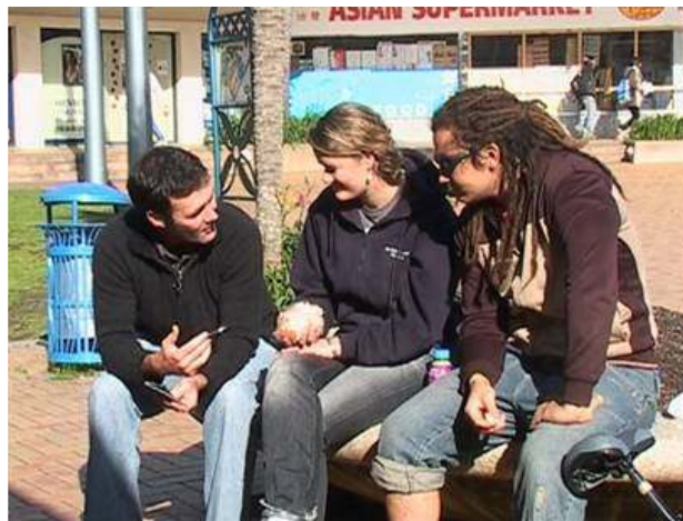
Sharing with a couple at Northcote shops

One of the unique features of the Kiwittracts ministry is that the goal is to share the Gospel with someone, somewhere each and every day. This verbal proclamation (speaking out the core Gospel message...sin, righteousness, judgement, Jesus as Saviour and Lord) is on top of tract and card distribution...it involves going to someone and sharing the Gospel message with them.